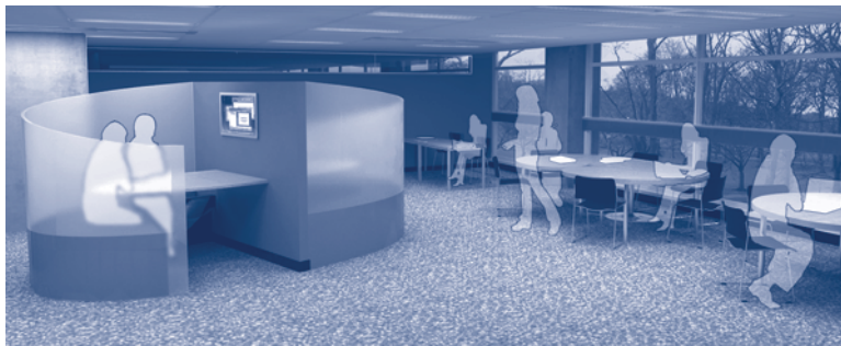
Artists impression of study pod, courtesy of architects Lewis & Hickey

We have had our first glimpse of the new 'Study Pods', as a mock-up has been installed on site. Designed for group study, these pods will seat up to eight people and be equipped with a PC, LCD screen, whiteboard, and sockets for a laptop and headphones. There are 18 pods going into a great study space on the Ground Floor where learning and conversation will go hand in hand.